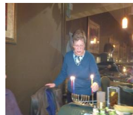
Eden's Grill 2nd night of Hanukah.