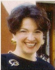
Experience Makes The Difference

The National Council of Jewish Women (NCJW) is a grassroots organization of volunteers and advocates who turn progressive ideals into action. Inspired by Jewish Values, NCJW strives for social justice by improving the quality of life for women, children and families by safeguarding individual rights and freedoms